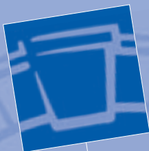
Keystone Award Luncheon

I am happy to provide this quarterly newsletter update. It is that time of the year when we get anxious for warmer weather and lots of sunshine. It's time to look forward to gardening catalogs, golfing, taking long walks without ice or snow and attending the Seniors Foundation Keystone Award Luncheon.